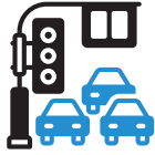
Traffic & Congestion

People filling out the neighborhood traffic mitigation ballots told us that they're concerned about: