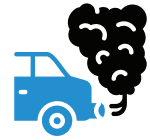
Environmental Impacts & Pollution

Each neighborhood had unique concerns and issues. All neighborhoods need more traffic calming solutions, projects and interventions. Each community had additional ideas and creative solutions to address the impacts from the detour routes.